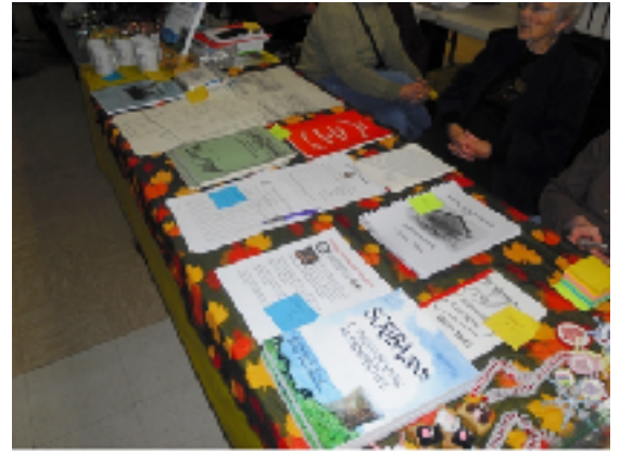
A closer look at the historical items at the Scriba Craft Fair 2024